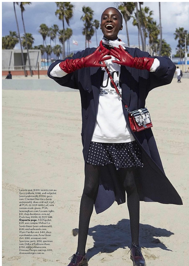
Lacoste coat, $1200, lacoste.com.au; Gucci paillover, $1180, and red jacket (worn underneath), $3550, gucci.com; Christian Dior dress (worn underneath), shoes and neck scarf, all POA, 02-9229 4600; LaCrasia custom-made gloves, POA, lacasia.gloves.com; Levante tights, $30, shop.davidjones.com.au; Prada bag, $3090, 02-9225 1688. Opposite page: ASOS jacket, $129, asos.com/au; Michael Lo Sorido blazer (worn underneath), $590, michaello.sorido.com; Wynn Hamlyn vest, $410, shop.wynnhamlyn.com; Anna Quan shirt, $380, annaquan.com; Sportmax pants, $350, sportmax.com; Dolce & Gabbana shoes, $1150, dolcegabbana.com; Dinosaur Designs earrings, $310, dinosaurdesigns.com.au.